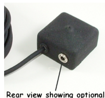
ear view showing optional daisy-chain jack

external mic from Sound Professionals that is matched to the two mics that are built into the USB sound card. The mic includes a daisy-chain jack so that an additional unit can be plugged into it. That would make four mics that would feed into the USB sound